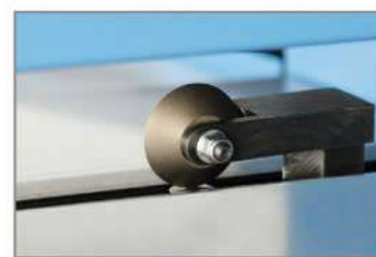
• Ultrasonic blade