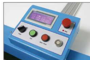
• Automatic stopper & Controls